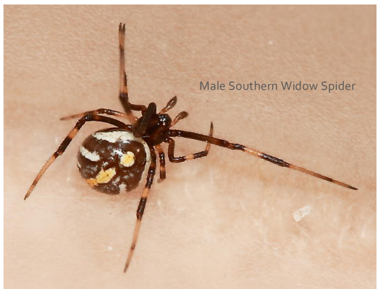
Male Southern Widow Spider