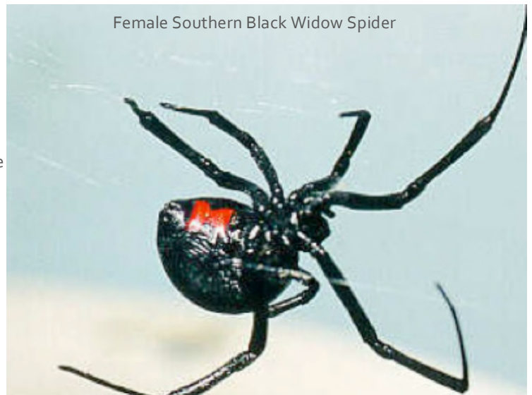
Female Southern Black Widow Spider

Very small children and the elderly are most at risk for serious health problems. Death from a black widow bite is extremely rare.